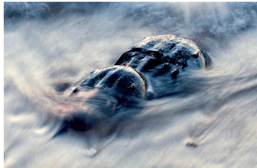
Mating horseshoe crabs are attracted to the temperate waters and calm wave action of the Delaware Bay. Sometimes as many as five or six male crabs will try to attach to the larger female crab at the same time.

A trademarked ERDGD program dubbed Just flip ’em! was launched in 1998 to encourage that simplest act of compassion: to gently lift any overturned crab one encounters by its shell — never by its tail — and flip it over. Even a child can do it, and Gauvry believes that once you “engage the passionate heart” with that first flip, it becomes more difficult to ignore the next one. “The next thing you know, you realize you’re an ambassador.” And saving a single horseshoe crab can, ultimately, save someone’s life.