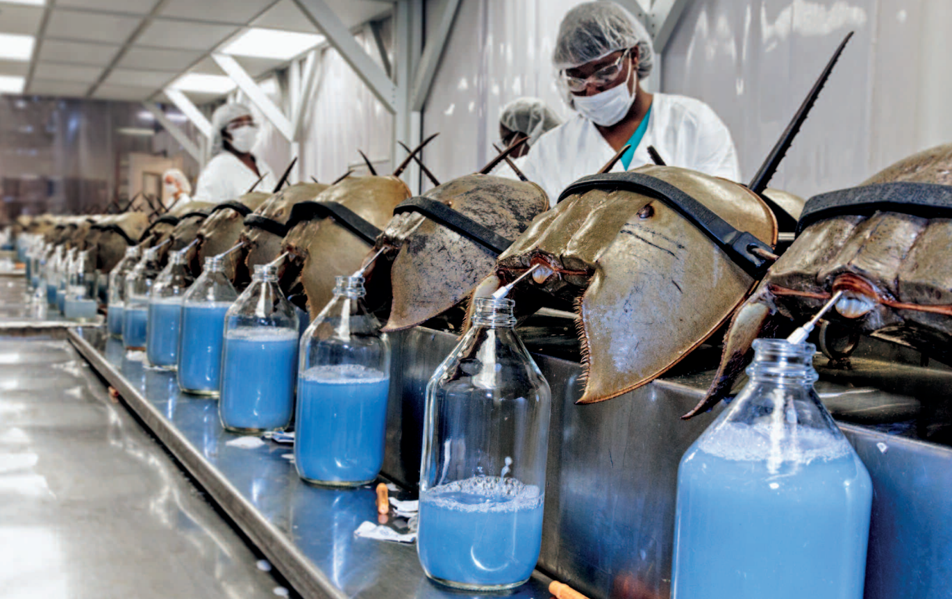
Horseshoe crab blood turns blue when oxidized, due to the presence of copper. Lab technicians extract the blood for its lifesaving qualities.

Well, in some quarters it does. Those who take the time to get up close and personal with the horseshoe crab know differently: This is an animal whose appearance belies its significance to mankind, and is worthy of not only respect but also our thanks.